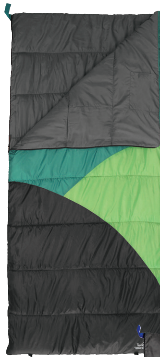
Gray Polyester Pongee Liner