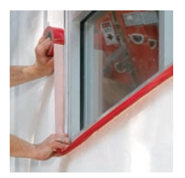
Masking exteriors prior to stucco applications

Scotch<sup>®</sup> Stucco Tape products stick securely and tear easily, making it quick and easy to prep buildings before the stucco process begins. They're tough enough to stand up to the damaging effects of the sun's UV rays. With a waterproof backing, they resist moisture, so a little rain won't cause your tape to fail. Scotch<sup>®</sup> Stucco Tape products resist tearing upon removal. With little or no adhesive transfer from wood, aluminum, vinyl and coated metal surfaces, cleanup is quick and easy.