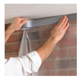
Hanging poly sheeting